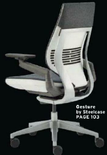
Gesture by Steelcase PAGE 103